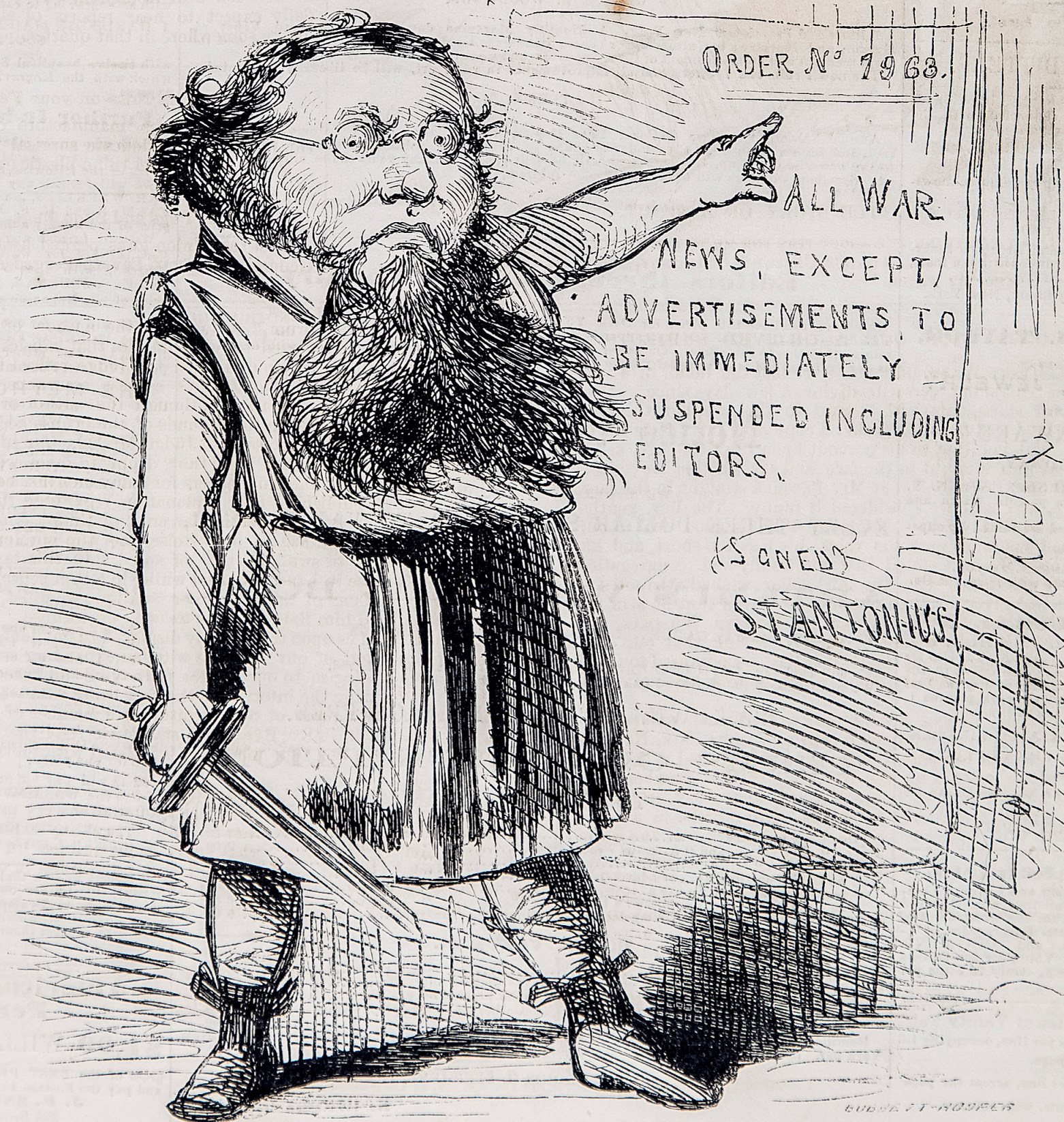
THE GREAT (IN)CENSOR OF THE PUBLIC PRESS.

PRICE THREE DOLLARS PER ANNUM-SINGLE COPIES SIX CENTS.